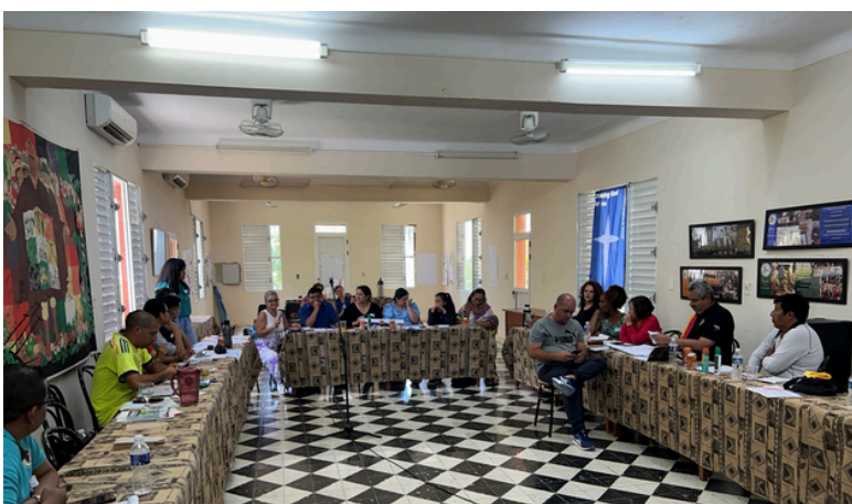
(Right): A group of participants, representing Cuba, Peru, Venezuela, and Bolivia, work through one of the case studies as part of the training