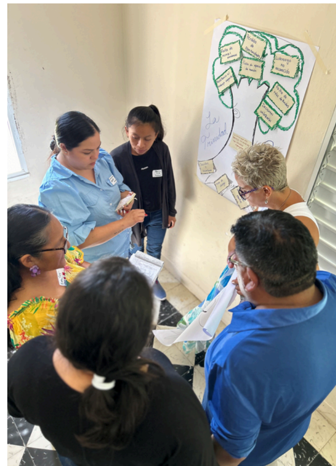
(Above): A group of participants, representing, Nicaragua, Guatemala, Cuba, Bolivia, Honduras, and Peru work through the problem tree, one of the tools we use for this training

This is the second event in these areas (the first in Mexico City, June 2023) that we have planned and implemented in our region, strengthening abilities of new, young, and diverse leaders of companion churches and institutions in the region.