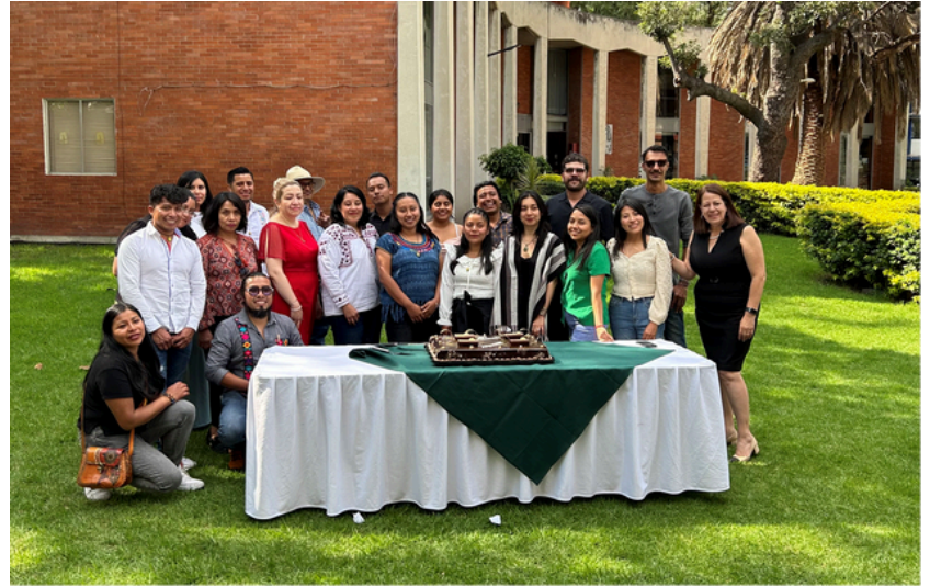
(right): Group photo from the event includes all of the current staff from Amextra.