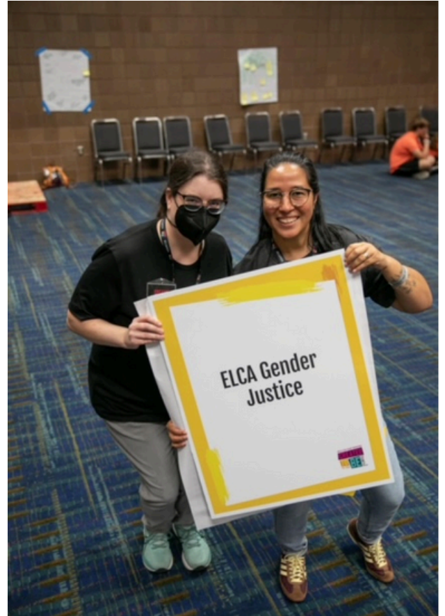
(Left): Youth participating in the Gender Justice Workshop during the ELCA Youth Gathering