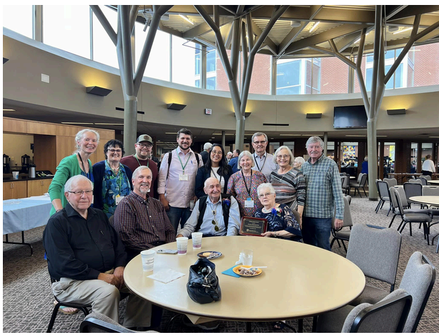
Left: With Current and Former members of South Dakota Companion Synod Committee